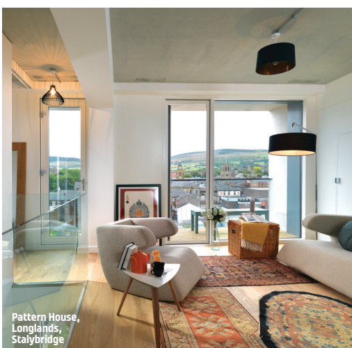
Pattern House, Longlands, Stalybridge